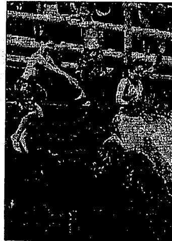
Everyone has their own style of plunging in.